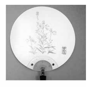
" MATSUYOIGUSA" Grass is drawn on the back.

(KYOTO JAPAN) -- Nissin Electric Co, Ltd has developed a luminous round fan named "YOIMACHI HOTARU